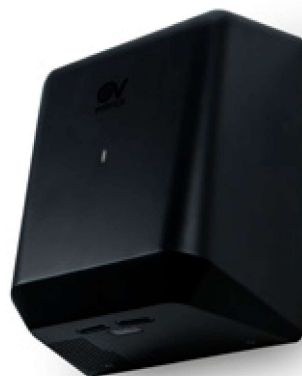
ECODRY EC code 19237 (automatic with brushless motor, low consumption)