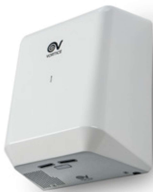
ECODRY code 19236 (automatic)