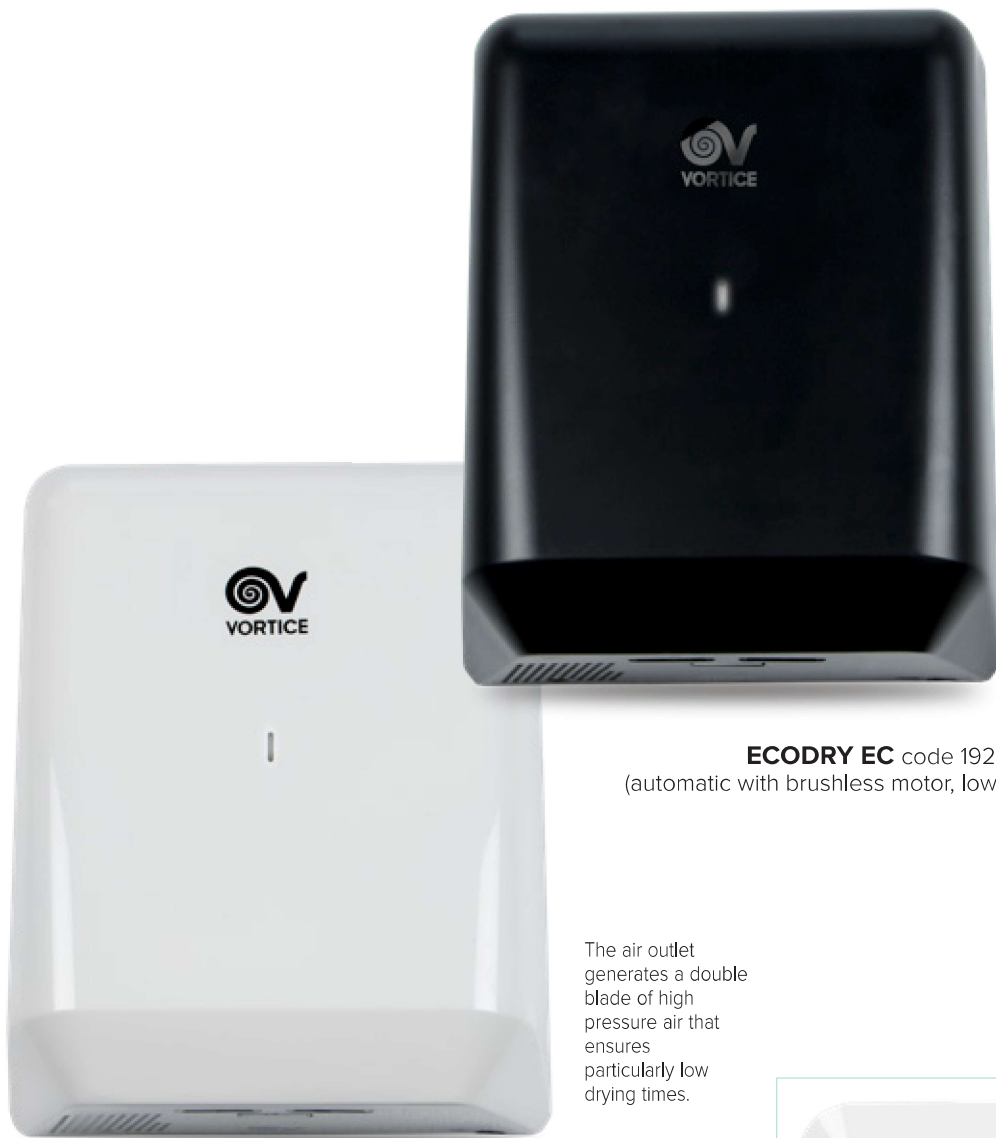
ECODRY EC code 19237 (automatic with brushless motor, low consumption)