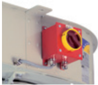
Outside connecting box. Fixing stand

Centrifugal long-range induction and jet fans 300°C/2h and 400°C/2h, for working within the fire danger zones, with low profile